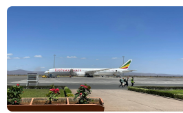
Kilimanjaro International Airport JRO