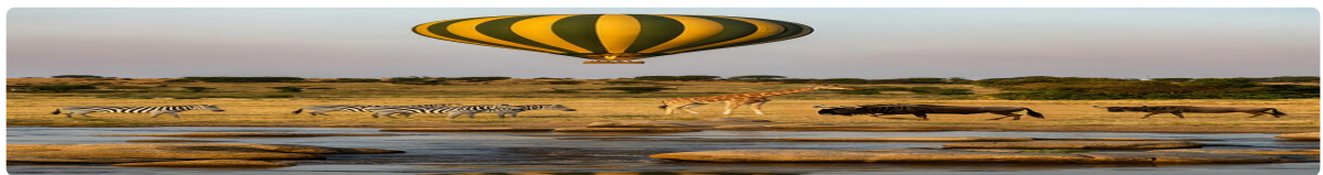
Nduvu & Southern Serengeti