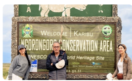
Ngorongoro Conservation Area