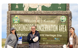
Ngorongoro Conservation Area