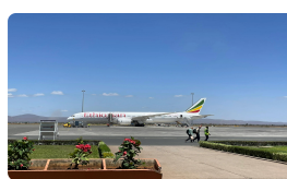
Kilimanjaro International Airport JRO