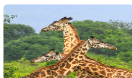
Arusha National Park