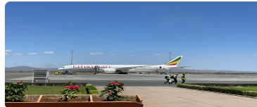
Kilimanjaro International Airport JRO