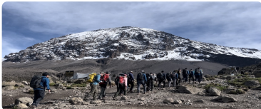
Kilimanjaro National Park