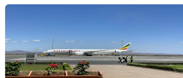
Kilimanjaro International Airport JRO