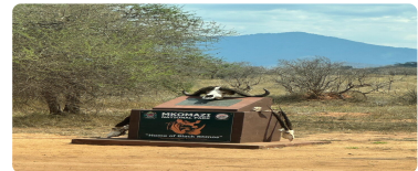
Mkomazi National Park