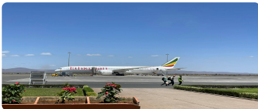
Kilimanjaro International Airport JRO