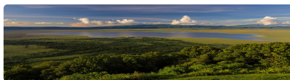
Ngorongoro Crater National Park