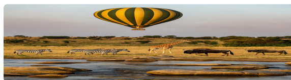
Ndutu & Southern Serengeti