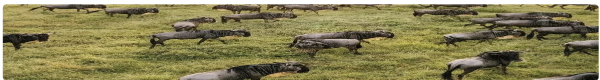
Nduvu Plains, Southern Serengeti