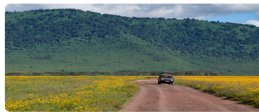
Ngorongoro Conservation Area