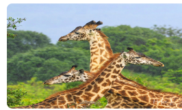
Arusha National Park