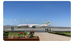
Kilimanjaro International Airport JRO