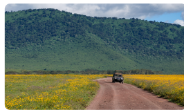
Ngorongoro Conservation Area