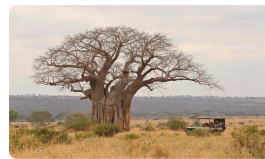
Tarangire National Park