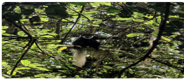
Kilimanjaro National Park