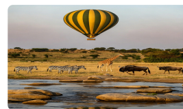
Nduvu & Southern Serengeti