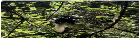
Kilimanjaro National Park