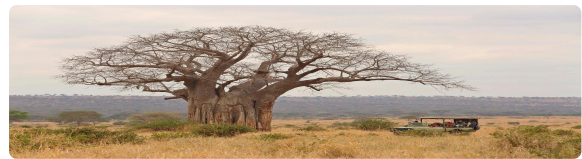
Tarangire National Park