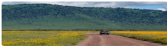
Ngorongoro Conservation Area