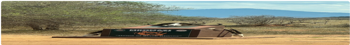
Mkomazi National Park