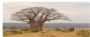
Tarangire National Park