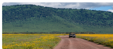
Ngorongoro Conservation Area