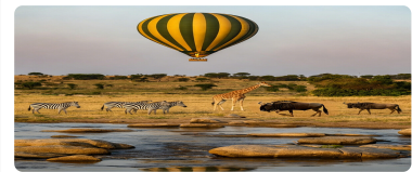
Ndu & Southern Serengeti