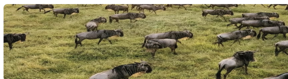
Ndutu Plains, Southern Serengeti