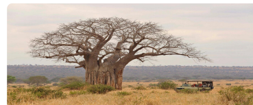
Tarangire National Park