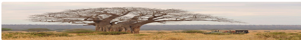
Tarangire National Park